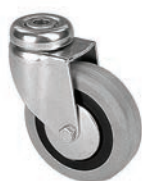
girevole foro per vite / bolt hole swivel castor