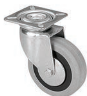
girevole piastra / swivel castor

Steel swivel housing on double ball races. Zinc plated finishing.