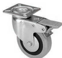
girevole piastra freno pedale anteriore / swivel castor with front brake foot lever