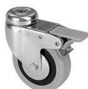
girevole foro per vite freno pedale anteriore / bolt hole swivel castor with front brake foot lever