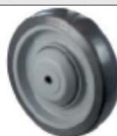
Kolo v prerezu