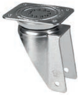
girevole piastra / swivel castor

High thickness pressed stainless steel AISI 304 components. Double ball races with stainless steel balls in AISI 420. Formed calibrated and lubricated ball race tracks. Grease nipple. Dust protection ring. Two bolts for fork's assembling. Stainless steel AISI 301 foot lever total brake with springs.