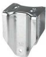
fisso piastra / fixed castor