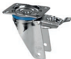
girevole piastra freno pedale anteriore regolabile / swivel castor with adjustable front brake foot lever