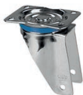
girevole piastra / swivel castor

Pressed stainless steel AISI 304 components. Double ball races with stainless steel balls in AISI 420. Calibrated and lubricated ball race tracks. Dust protection ring. Riveted pin for housing's assembling Special lubrication for use at temperatures from -15°C to +280°C when required. Stainless steel AISI 301 foot lever total brake with springs.