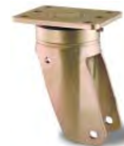
SUPPORTO GIREVOLE SWIVEL CASTOR

Pressed steel and welded housing swivel on axial ball bearing and on tapered roller bearing. Yellow passivated finishing.