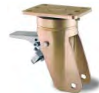
SUPPORTO CON FRENO POSTERIORE HOUSING WITH REAR TOTAL BRAKE