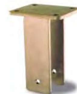
SUPPORTO FISSO FIXED HOUSING