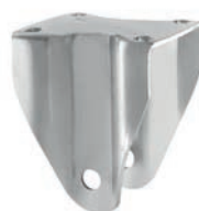
fisso piastra / fixed castor