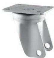
girevole piastra / swivel castor

High thickness, pressed steel, zinc-plated components. Double ball races with pressed and calibrated steel balls. High-resistance, bolted central pin for assembling. Special lubrication for use at temperatures from 15°C to +130°C. Rear foot lever total brake. High load capacity.