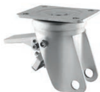
girevole piastra freno pedale posteriore / swivel castor with rear brake foot lever