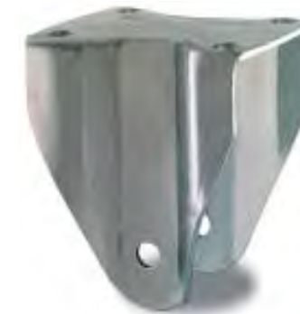
SUPPORTO FISSO FIXED HOUSING