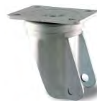
SUPPORTO GIREVOLE SWIVEL CASTOR

Zinc plated pressed steel housing or stainless steel AISI 304 swivel on double range of balls. Total adjustable brake system for the wheel and the housing.