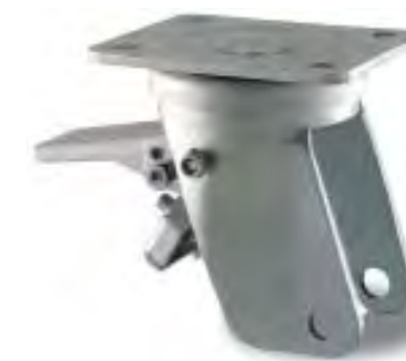
SUPPORTO CON FRENO POSTERIORE HOUSING WITH REAR TOTAL BRAKE