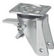
girevole piastra freno pedale posteriore / swivel castor with rear brake foot lever