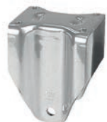
fisso piastra / fixed castor