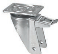
girevole piastra freno pedale anteriore / swivel castor with front brake foot lever