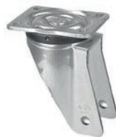
girevole piastra / swivel castor

Special lubrication for use at temperatures from 15°C to +130°C.