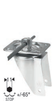
girevole piastra freno centrale integrale a camma / swivel castor total central lock with cam