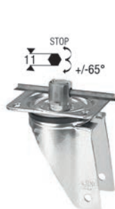
girevole piastra freno centrale integrale a camma / swivel castor total central lock with cam