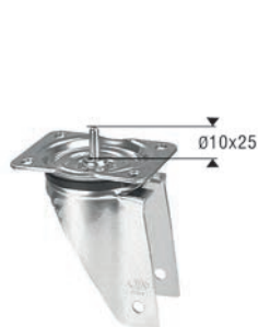
girevole piastra freno centrale integrale spintore / swivel castor with push central lock