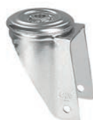
girevole foro per vite / bolt hole swivel castor